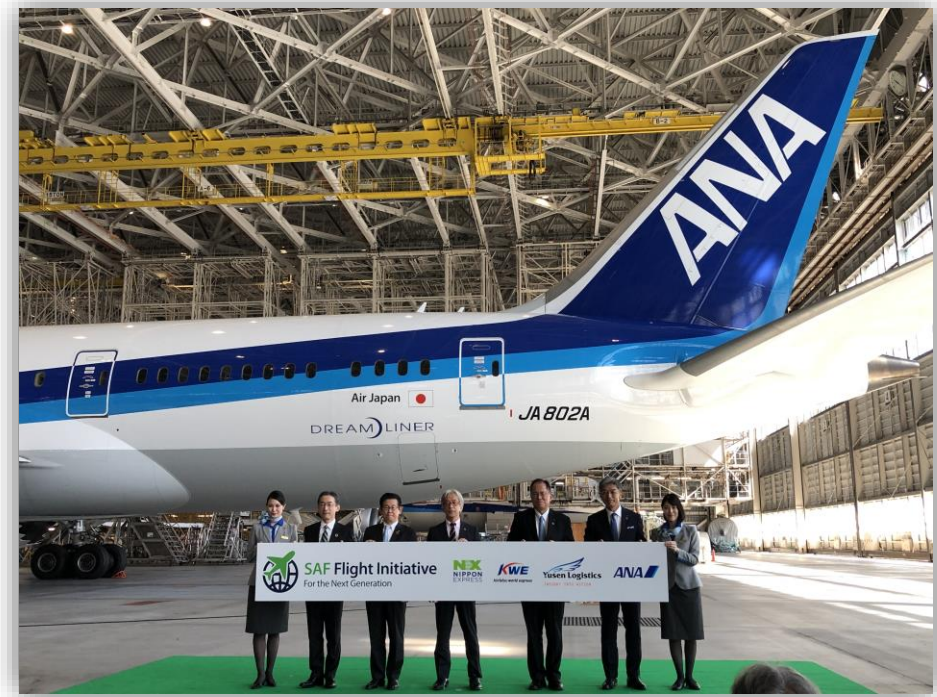
6 Nov, 2020 NH114 Tokyo/Haneda to Houston