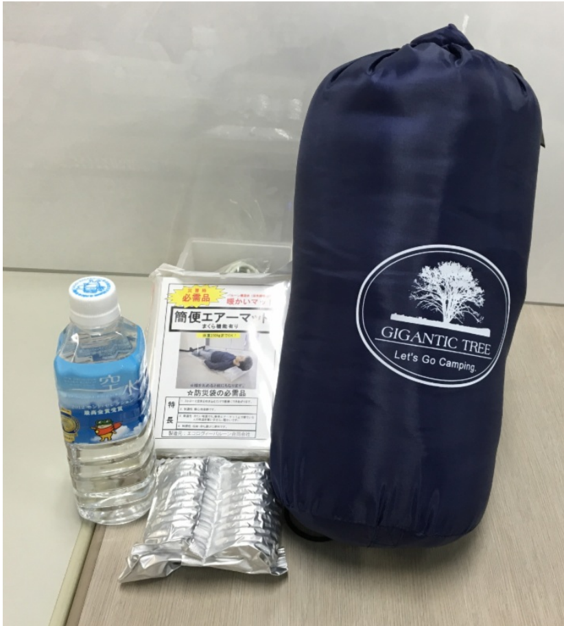
From left, clockwise: a bottle of water, a pad for the floor, a sleeping bag, a package of crackers.

In order to alleviate the hunger and thirst of passengers who were forced to spend the night in the terminals, NAA distributed a bottle of water and a package of crackers to each passenger. They also extended the business hour of the shops and restaurants in the terminals. NAA distributed sleeping bags as minimum bedding for each passenger, so that they were able to sleep on the floor of the terminals. Because elderly people and children may have found it difficult to sleep on a hard floor, pay lounges that were equipped with couches were opened, and staff guided passengers to the lounges. This course of action also helped the situation by preventing trouble between passengers that may have been caused by infants crying etc.